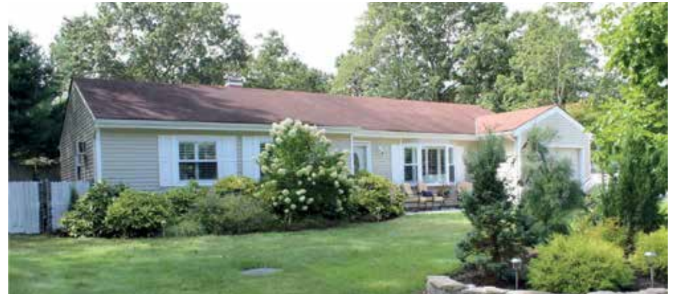
Ridge—$329,000 Well maintained, move-in ready 3 bedroom ranch on quiet block. Private backyard with beautiful Koi pond.