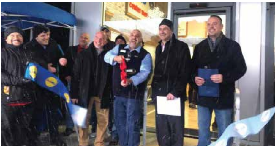
Local elected officials, employees, and residents cut the ribbon to welcome Lidl to the community.