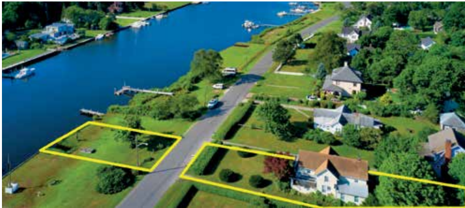
Center Moriches—$699,900 Classic 4 bedroom, 2 bath waterfront Victorian farmhouse on 2.5 acres. Great water views!