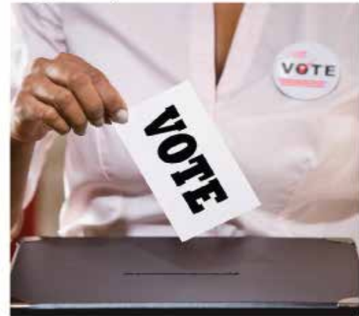
The Manic-Moriches-Girley Community Library earned the green light to move forward with a bond to finance $6.5 million in renovations, after the community voted in approval by a slim margin.