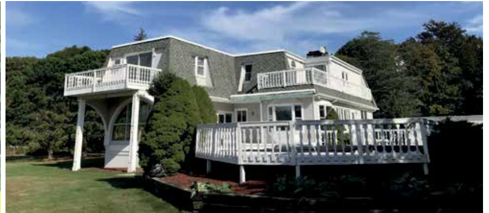
Center Moriches—$799,900 Spacious 4 bedroom, waterfront home on Areskonk Creek. 200 ft. bulkhead with dock and boat lift.