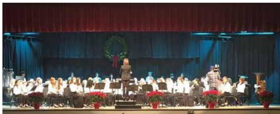
Center Moriches Middle School Band placed first in News 12's annual Sounds of the Season competition, held last month.