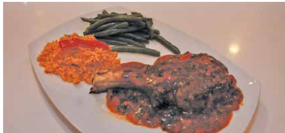
The pork chop is served with a light but flavorful garlic sauce.

Freck said he also keeps a good stock of quality Spanish wines. For inquiries about catering or renting the space, call 631-909-1985. ■