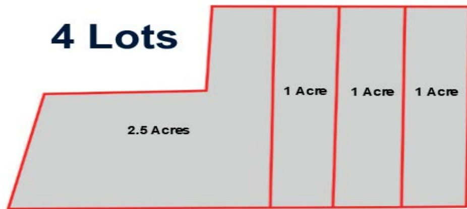
East Moriches—$995,000 4 separate lots for sale on 5.53 acres! Residential and mixed use. 394 feet of frontage on Frowein Road.