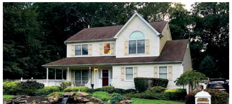
Baiting Hollow—$539,000 Spacious 3 bedroom, 2.5 bath beautifully kept home on Long Island's desirable North Fork.