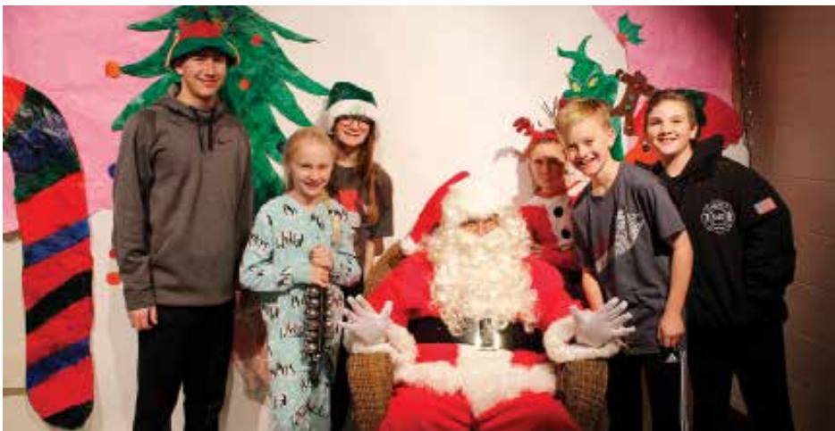
Students from the Center Moriches art club join with Santa as he waits to hear from children who want presents.

The event was a team effort between the art department, the art club, and the Interact club. ■