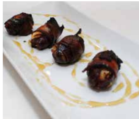
The bacon-wrapped dates stuffed with goat cheese are the perfect savory appetizer.