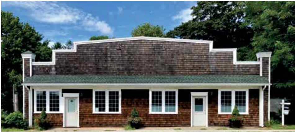
East Moriches—$599,000 Commercial property in prime East Moriches Main Street location. 2 storefronts with storage above.